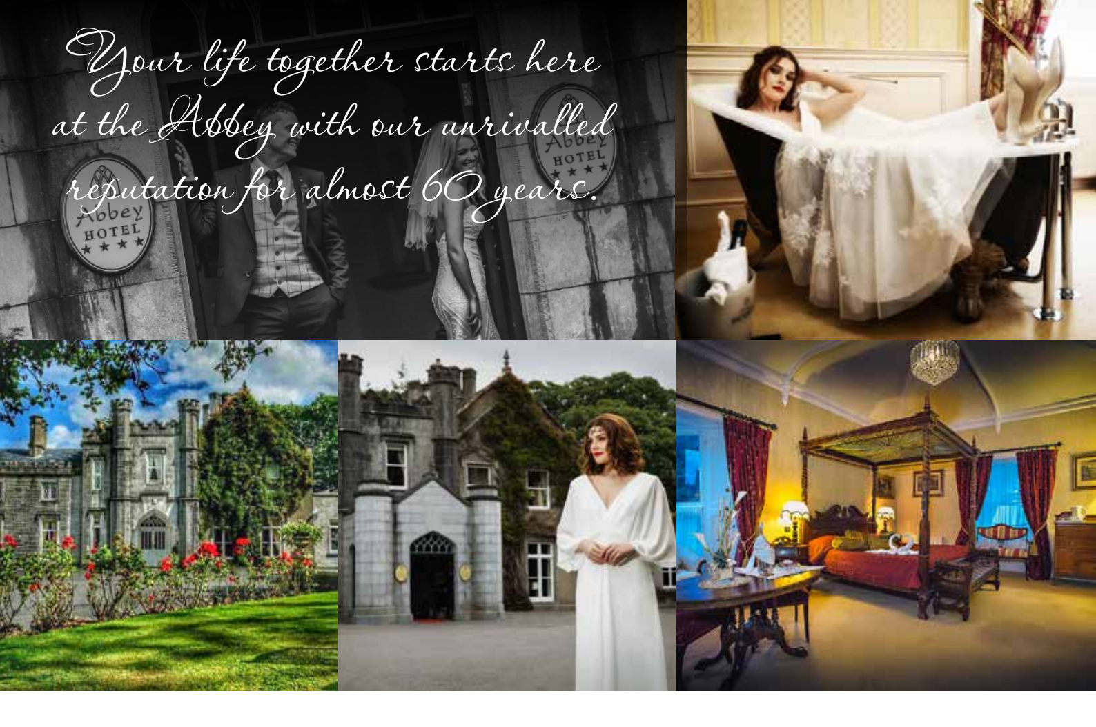
"You don't love someone for their looks, or their clothes, or for their fancy car, but because they sing a song only you can hear." OSCAR WILDE